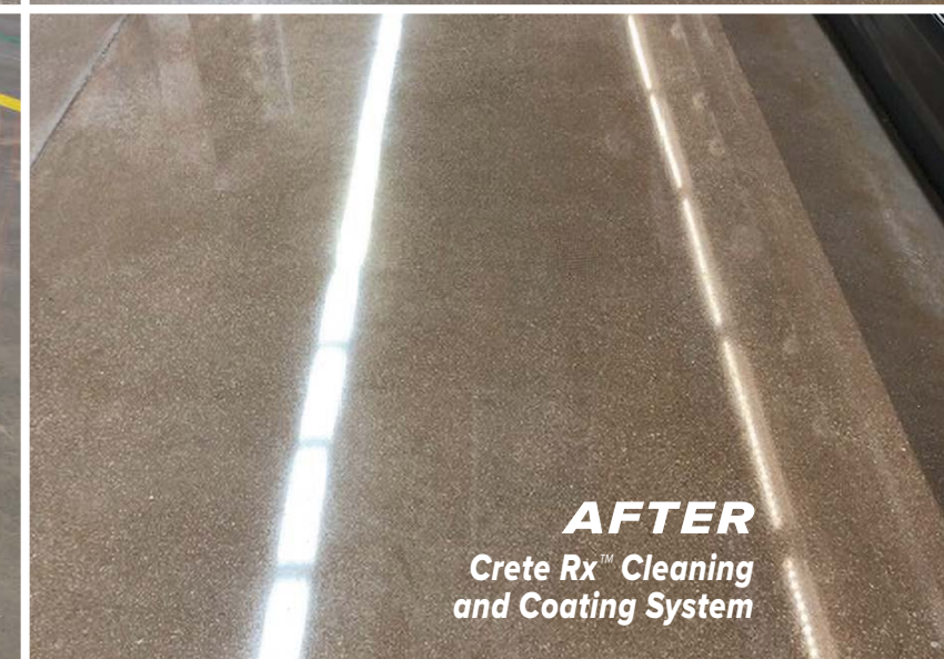
AFTER Crete Rx™ Cleaning and Coating System