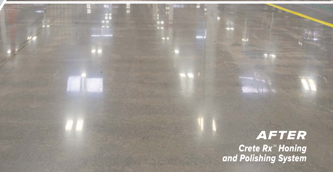
AFTER Crete Rx™ Honing and Polishing System