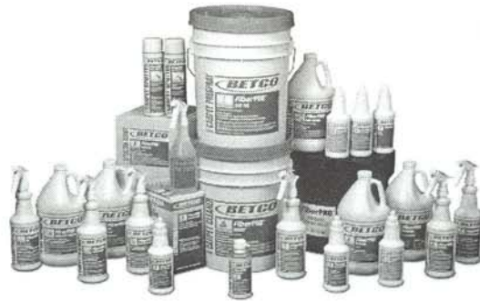
Complete Carpet Care Program.