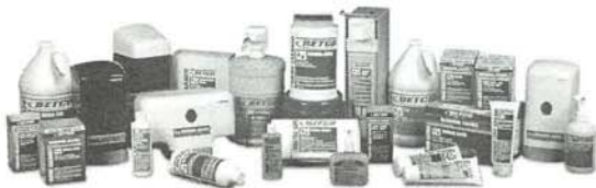
Complete Hand Cleaner Line.