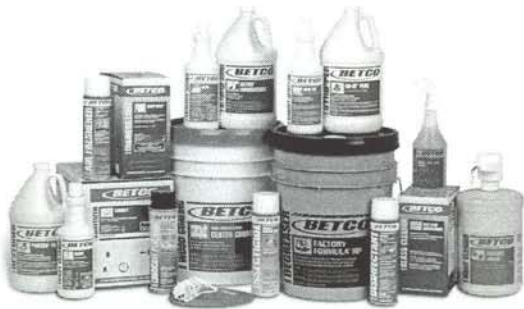
Complete Chemical Programs, Cleaners, Floor Care and specialties.

Betco is now the only manufacturer with a complete line of products for the cleaning professional.