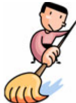
Understanding the CIMS