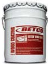
Betco® OMU 350