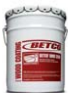
New OMU Formulas