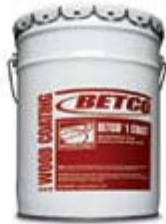
Betco® 1 Coat