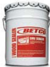
Betco® OMU Sealer

Need help selecting the right product for your floor? Contact your Betco regional manager and ask for their expertise.