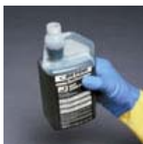
Fastdose Expands Offering