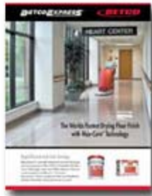
Betco Express® Floor Care Program Sell Sheet