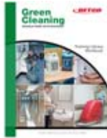
Literature Library Additions