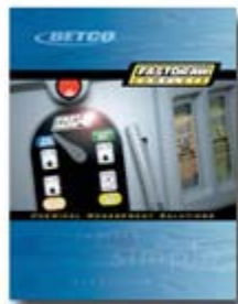
FastDraw® Complete Brochure

Not only did we introduce new pieces, we made updates to several of our most popular brochures and sell sheets to help communicate the benefits of Betco's innovations better. Here's a look at a few that were updated: