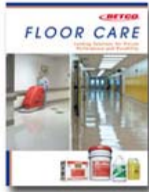
Floor Care Brochure