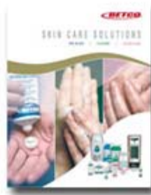
Skin Care Solutions

Not only did we introduce new pieces, we made updates to several of our most popular brochures and sell sheets to help communicate the benefits of Betco's innovations better. Here's a look at a few that were updated: