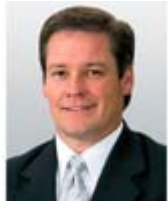
New Division Manager Named