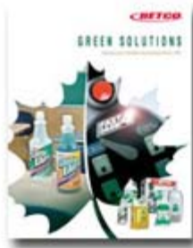
Green Solutions Brochure