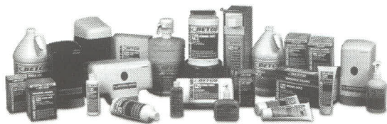
Complete Hand Cleaner Line.