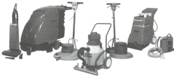
Complete Floor Machine, Vacuum and Scrubber Line.

Betco is now the only manufacturer with a complete line of products for the cleaning professional.