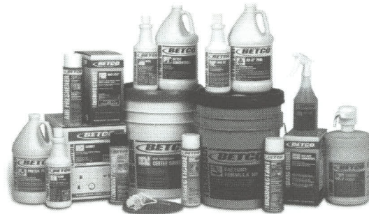
Complete Chemical Programs, Cleaners, Floor Care and specialties.