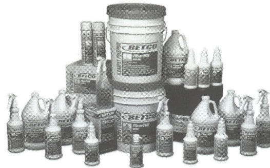
Complete Carpet Care Program.