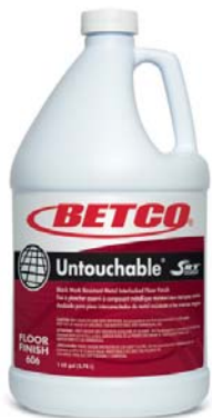
Untouchable® with SRT™