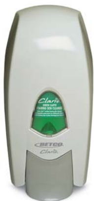
Clario® Skin Care Dispenser

Betco SportsZone® offers the most comprehensive sports floor recoating systems and wood floor maintenance products.