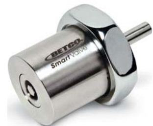
SmartValve® Water Conservation Component Patent# 8,256,037

Through this philosophy, Betco continues to bring tomorrow's innovative cleaning technologies, such as the patented SmartValve® Water Conservation Component , with today's cost savings.