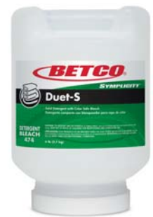
Symlicity™ Green Earth® Duet-S

Betco® Symlicity™ Laundry and Warewashing Program is specifically designed for the foodservice, hospitality and healthcare markets, offering “clean” in a simple and safe way.