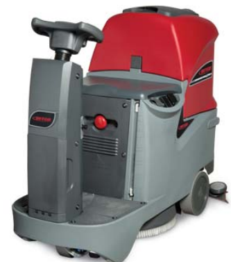
Stealth™ DRS21BT MicroRider™

Betco's Stealth™ Auto Scrubbers are the quietest powered equipment in the industry making day cleaning a reality.