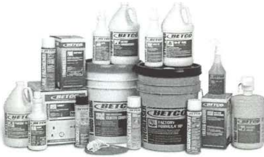
Complete Chemical Programs, Cleaners, Floor Care and specialties.

Betco is now the only manufacturer with a complete line of products for the cleaning professional.