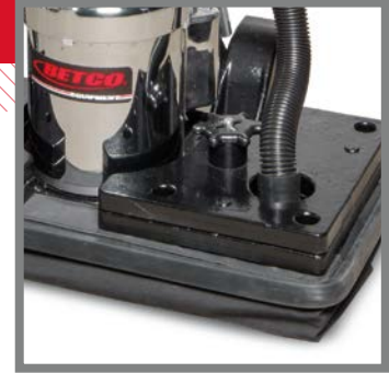
Optional dust containment kit available for all models