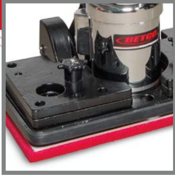
Durable cast iron base and weights provide maximum head pressure