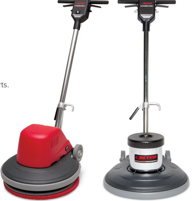
Item #E83013 Crewman™ 17HD Item #E83014 Crewman™ 20HD Item #E83010 Foreman® 20DS