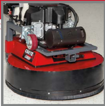
Rugged, powder-coated, thick steel frame