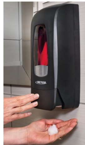
Manual Black or White Dispensers Foam and Lotion/Gel