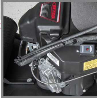
Powerful 17 HP motor that exceeds EPA/CARB emission requirements