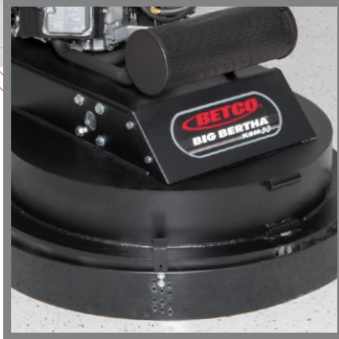
Rugged powder coated steel construction