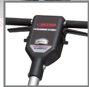
Easy view amp meter monitors total amp draw which can be easily adjusted