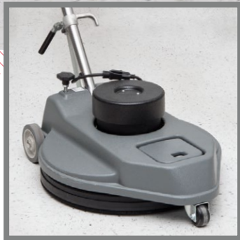
Fully adjustable handle (Cord-electric version)