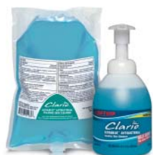
75929-00 / 75957-00 Clario™ UltraBlue™ Antibacterial Foaming Skin Cleanser