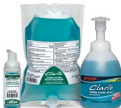
77429-00/77457-00 77453-00 Clarío™ Foaming Alcohol Instant Hand Sanitizer

The Clarío™ line of instant hand sanitizers is formulated to kill 99.9% of germs that can cause disease and work in as little as 15 seconds. Instant hand sanitizers should be used when soap and water are not available. Clarío™ Skin Care foam and gel sanitizers leave your hands refreshed. Foaming hand sanitizers are available in both alcohol and non-alcohol formulations. Clarío™ Alcohol Free Foaming Hand Sanitizer is ideal for alcohol restricted facilities, is non-flammable and won't damage floors.