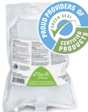
71529-00 Clario™ Clear Foaming Skin Cleanser