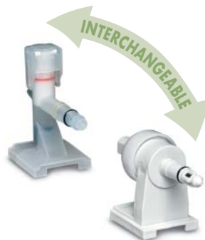
91830-00 Lotion Pump 91829-00 Foam Pump Changing between liquid and foam is a SNAP with interchangeable pumps. The modular pumps can easily be switched between liquid and foam without taking the dispenser off the wall! The cover is also modular for easy replacement without removing the dispenser from the wall.