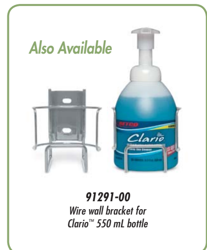
91291-00 Wire wall bracket for Clario™ 550 mL bottle