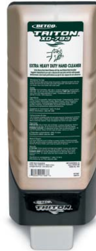
#91828-00 Triton™ 4 L Dispenser

Betco's Triton™ Skin Care line gives you powerful cleansers to dissolve tough soils in mere seconds. Triton's durable, yet practical dispensers set a new value in heavy duty and large quantity dispensing. The sleek durable ABS construction is strong and requires no maintenance. Factory sealed 2L or 4L bottles are easy to load, store and handle. The Triton™ Skin Care system is perfect for maintenance shops, factories, and facilities where a heavy duty cleaner is needed.