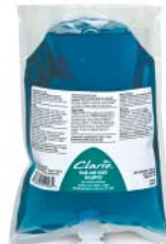
74629-00 Clario™ Hair and Body Shampoo