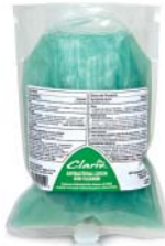
74029-00 Clario™ Antibacterial Lotion Skin Cleanser