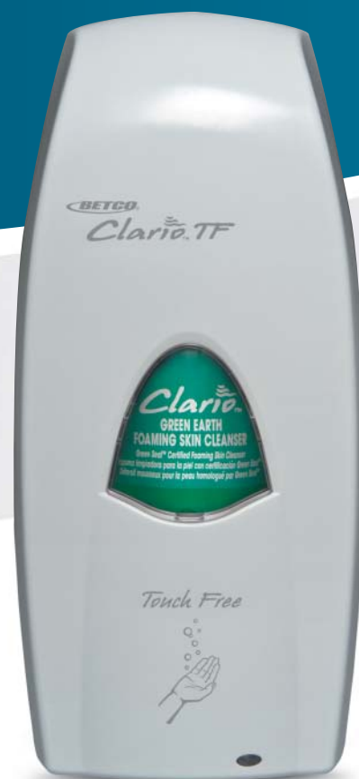
91866-00 Touch Free, Foam Dispenser - White