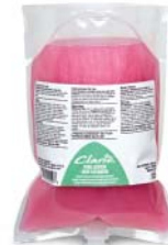
71229-00 Clario™ Pink Lotion Skin Cleanser