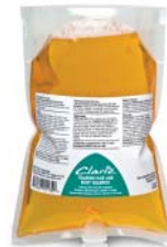
75829-00 Clario™ Foaming Hair and Body Shampoo