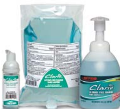
77829-00/77857-00 77853-00 Clarío™ Alcohol Free Foaming Hand Sanitizer