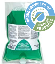
78029-00 Clario™ Green Earth® Lotion Skin Cleanser