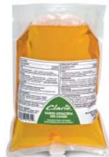
75729-00 Clario™ Foaming Antibacterial Skin Cleanser