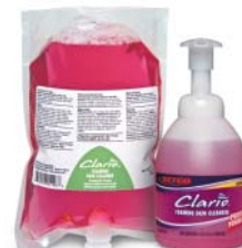
75629-00 / 75657-00 Clario™ Foaming Skin Cleanser