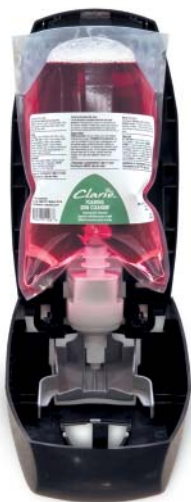
91822-00 Foam Dispenser - Black 91820-00 Lotion Dispenser - Black Holds a 1000 mL factory sealed refill. Delivers more than 1,660 uses per refill. Includes an optional key lock.