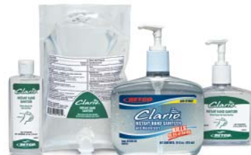
77629-00/77669-00 77668-00/77624-00 Clarío™ Instant Hand Sanitizer