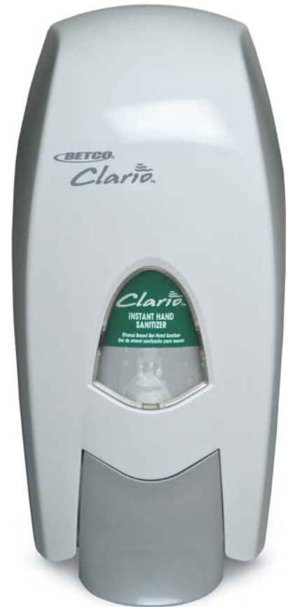
91821-00 Foam Dispenser - White 91819-00 Lotion Dispenser - White