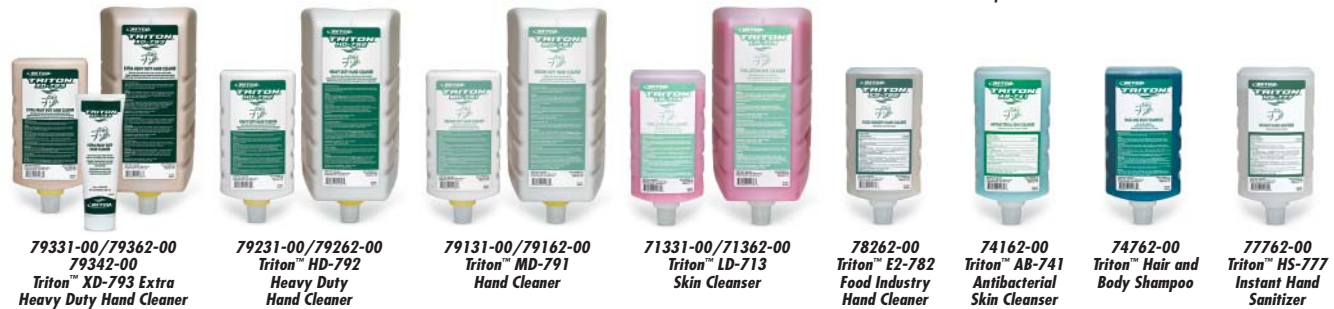
79331-00/79362-00 79342-00 Triton™ XD-793 Extra Heavy Duty Hand Cleaner