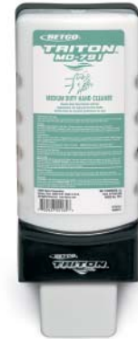
#91827-00 Triton™ 2 L Dispenser