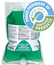
78129-00 Clario™ Green Earth® Foaming Skin Cleanser