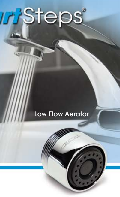
Low Flow Aerator