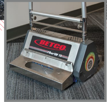
Optional side mounted dust bins transform machine into a 15" sweeper