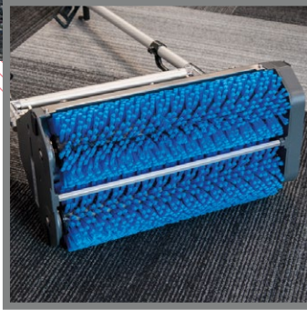
Twin cylindrical brushes lift the pile and agitate cleaner into all sides of the carpet fiber