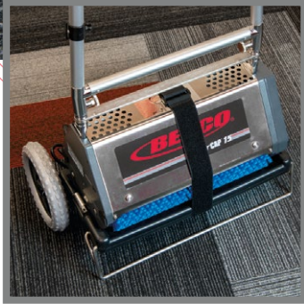
Durable storage and transport trolley included