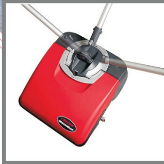
360° motion to clean in all directions