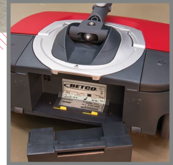
Lithium ion battery with 3 year full warranty