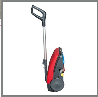
Easy Storage - takes less space than a mop & bucket